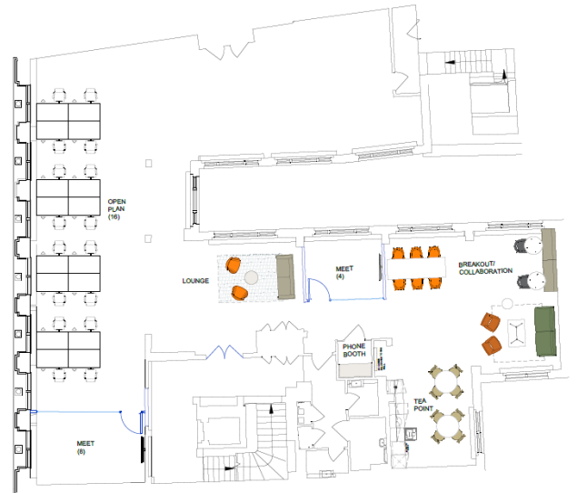
3 rd Floor Cat A +